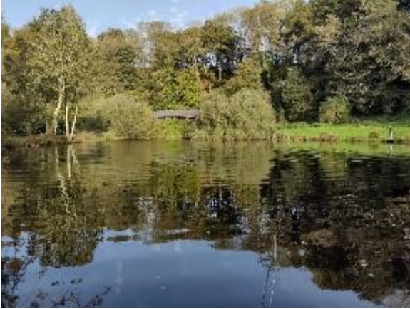
Lovely 'Indian Summer' day by one of Tavistock Trout Fishery's lakes