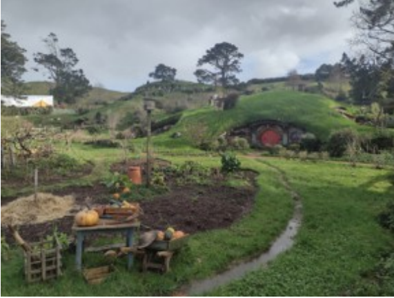
Hobbiton - The Shire