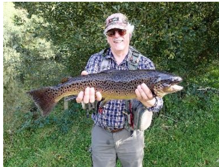
That is the sight of a very happy fisherman. Don't worry it didn't bite off my left index finger, that's on the other side of the fish.

My first brown trout and what a beauty, at 6lb! ☺ ☺ ☺. I've even got a mention on the fishery's Facebook page as I had the biggest brown so far this season!