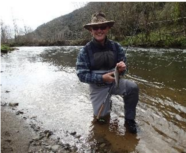
A trout, but not as big as Bullroarer Took's 'Old Brown'

There were fish though and some people seemed to have either the right spot, the right fly or the right technique and / or all of the aforementioned and caught a few. However, they were more fit for a starter rather than a main course....(the voice of jealousy speaking?)