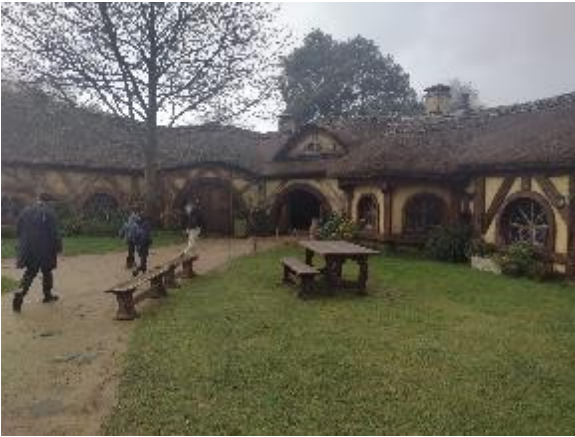
The Green Dragon