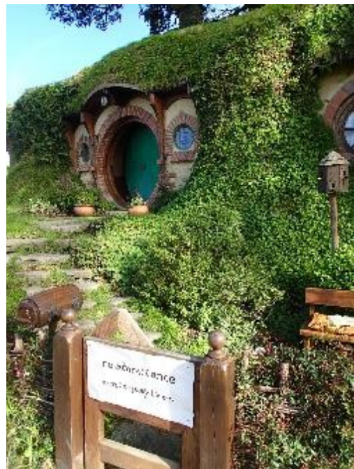
Bag End getting ready for Bilbos' 11-1 st birthday

On my first weekend in New Zealand a visit to Bag End and a beer in the Green Dragon confirmed that there were brown trout in Hobbiton and by implication in New Zealand too, albeit the size was somewhat disappointing. Having said that Bullroarer Took no doubt had a fight on given his relative size compared to 'Old Brown'.