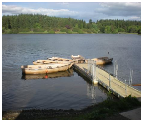
Boats moored up for next year and an end to my third year in Dartmoor!