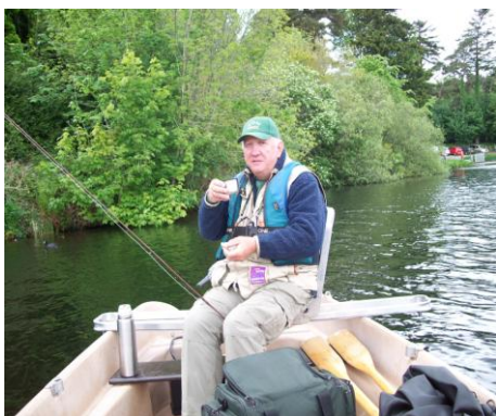
Yours truly in a quieter moment!