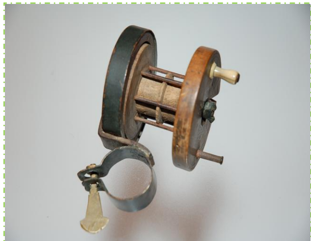
(Classic Fishing Tackle).