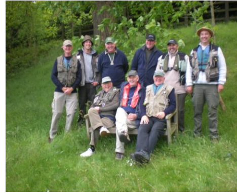
The guys at lunch break on the first day