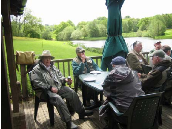
Lunch time break

The conditions were far from ideal – it was blowing a hooley and very much sunshine and showers, with the showers prevailing! Nevertheless a couple of rods bent early on, but on the whole fishing was not easy.