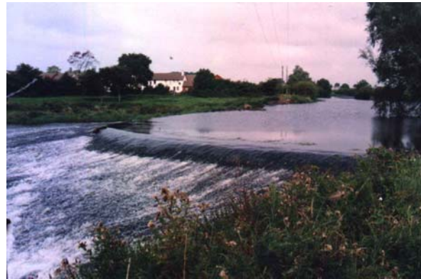
Fig. 1 – Randalstown Weir (Before Fish pass)

In the spring of 1998, the Fisheries Conservancy Board of Northern Ireland commissioned Fishway Engineering to design and supervise construction of a fish counter on the River Main at Randalstown, Co. Antrim in order to provide data for fisheries management. See Figure 1.