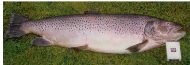
Figure 2 – Dollaghan Trout

The counter was to count salmon, sea trout and dollaghan trout. Dollaghan are a sub-species of brown trout only found Northern Ireland. They spend the growing phase of their live cycles in Lough Neagh, migrating to rivers to spawn. Migration takes place during march to October and smolts descend to the Lough during April and May. Dollaghan can grow up to 10kg in weight, due to the rich food source in the Lough. See Figure 2.