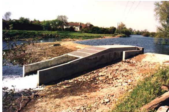
Figure 3- Completed Project

A shield protects the pass from floating debris and together with covers gives a measure of protection against poachers. Signals from the counting electrodes are passed to an on site instrument and computer for analysis and recording. A modem linked to a mobile phone allows for remote interrogation of the system. See Figure 3.